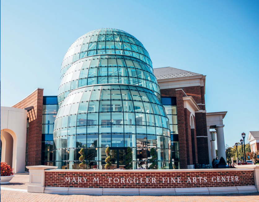
MARY M. TORGGGLER FINE ARTS CENTER